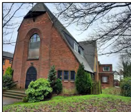
St. Columbas Church