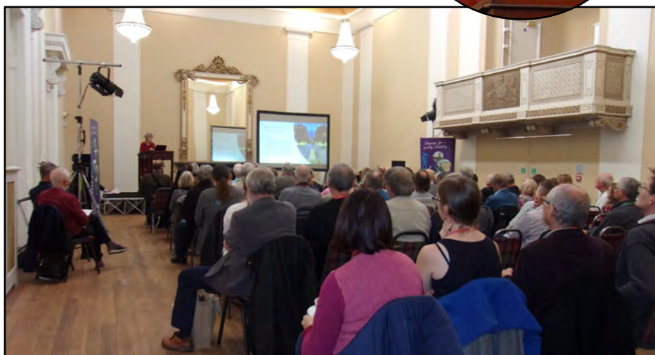
Heritage Conference in Drapers Hall