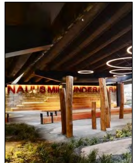
Naul's Mill Underpark