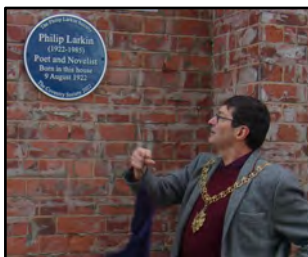
Cllr Kevin Maton, Lord Mayor of Coventry