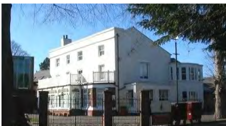
The 'Firs' Coventry Prep School

We submitted the new Ring Road Under Pass Park, known as Naul's Mill Underpark, for the Royal Fine Art Commission Trust Building Beauty Awards, again unfortunately without success.