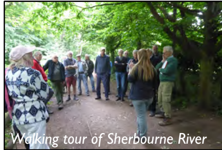
Walking tour of Sherbourne River