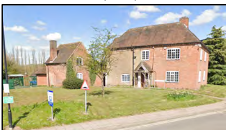
Gibbet Hill Farmhouse