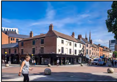
Burges/Hales St. development

In the absence of a proper review of Coventry Heritage Active Zone, we published our own review, which showed that the HAZ had done well in relation to our medieval heritage, but failed miserably with our 20 th Century heritage.