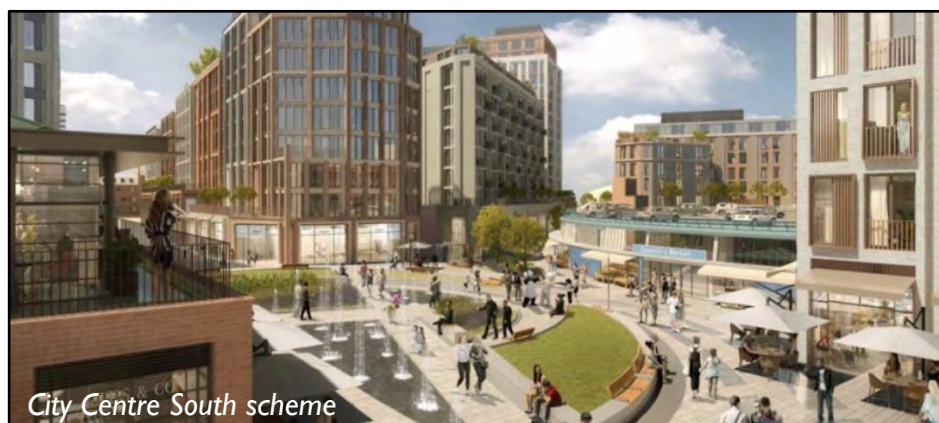
City Centre South scheme

We also supported the plans to establish Conservation Area in Earlsdon and Brownhill Green.