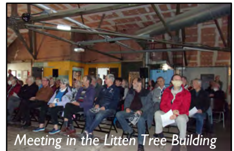
Meeting in the Litten Tree Building