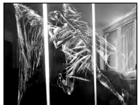
The framed Hutton drawing with reflections

We made a contribution towards the cost of returning one of the Hutton sketches to the Cathedral, in support of the Friends of Coventry Cathedral.