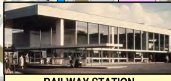
RAILWAY STATION Hedley and Shorten Architects for British Railways. 1962-6. Influenced by Scandinavian design, high glass sides and open structure.