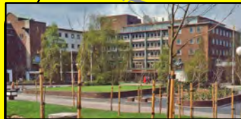
BROADGATE HOUSE Coventry City Architects, Gibson/Moate 1948-53. Gibson's design materials, offices, shops and arcading canopy covered walkway.