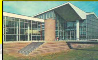
SWIMMING BATHS Ling & Gregory McLellan 1962-6. Impressive main pool with a butterfly cantilevered roof, high glazing looking out onto the gardens.