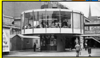
LOWER PRECINCT Ling and Coventry City Architects staff 1957-60. Completed after Donald Gibson City Architect had left the city.