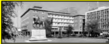
LEOFRIC HOTEL, BROADGATE Hattrell and Partners 1948-54. Originally the top hotel in Coventry, now student accommodation..