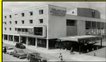
BELGRADE THEATRE Ling, King and Beeton 1955-68. The first municipal theatre built in England after the War, hidden within the arcade of shop fronts.