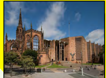
CATHEDRAL OF ST. MICHAEL Architect Sir Basil Spence Design Competition 1950. Construction commenced 1954 and consecrated in 1962.