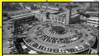
CITY MARKET Ling with Beaton & Bradley and Berry City Engineer. 1956-7. Doughnut shaped 200 stall market, roof car parking.