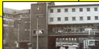
LADY GODIVA CLOCK & BRIDGE RESTAURANT Coventry City Architects, Gibson/Moate 1948-53. There are many pieces of public art attached to all sides of the building.