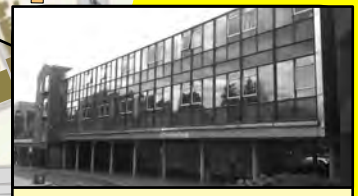
CIVIC ARCHITECTURE & TOWN PLANNING Sample materials were used in a number of places to see how they would stand the test of time.