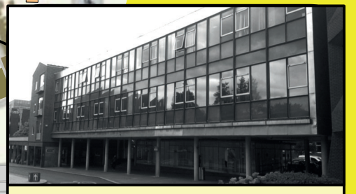
CIVIC ARCHITECTURE & TOWN PLANNING Sample materials were used in a number of places to see how they would stand the test of time.