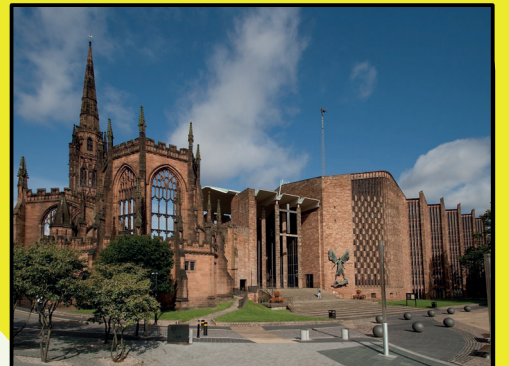
CATHEDRAL OF ST. MICHAEL Architect Sir Basil Spence Design Competition 1950. Construction commenced 1954 and consecrated in 1962.