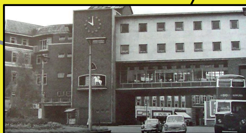
LADY GODIVA CLOCK & BRIDGE RESTAURANT Coventry City Architects, Gibson/Moate 1948-53. There are many pieces of public art attached to all sides of the building.