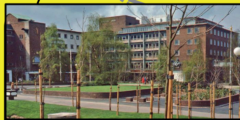
BROADGATE HOUSE Coventry City Architects, Gibson/Moate 1948-53. Gibson's design materials, offices, shops and arcading canopy covered walkway.