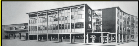
COVENTRY EVENING TELEGRAPH LA Culliford & Partners 1956-60. Gibson's arcading scheme along Corporation Street. Note slight curve on both wings of the building.