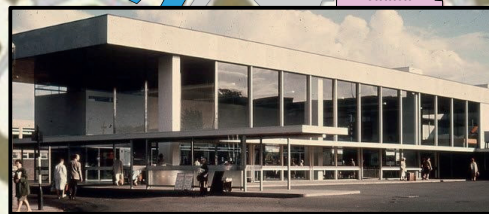
RAILWAY STATION Hedley and Shorten Architects for British Railways. 1962-6. Influenced by Scandinavian design, high glass sides and open structure.