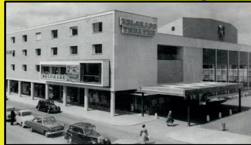
BELGRADE THEATRE Ling, King and Beeton 1955-68. The first municipal theatre built in England after the War, hidden within the arcade of shop fronts.