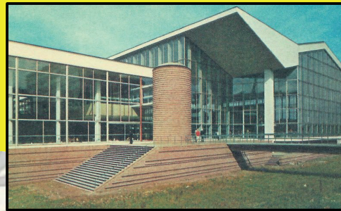
SWIMMING BATHS Ling & Gregory McLellan 1962-6. Impressive main pool with a butterfly cantilevered roof, high glazing looking out onto the gardens.