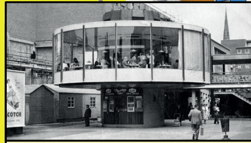
LOWER PRECINCT Ling and Coventry City Architects staff 1957-60. Completed after Donald Gibson City Architect had left the city.