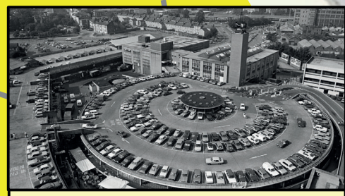
CITY MARKET Ling with Beaton & Bradley and Berry City Engineer. 1956-7. Doughnut shaped 200 stall market, roof car parking.