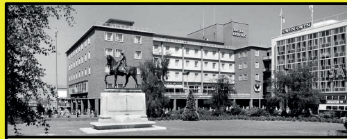
LEOFRIC HOTEL, BROADGATE Hattrell and Partners 1948-54. Originally the top hotel in Coventry, now student accommodation..